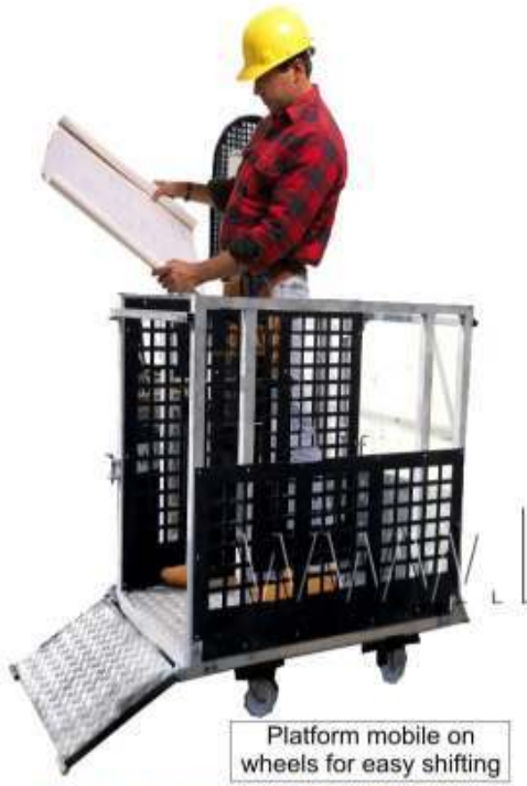
Platform mobile on wheels for easy shifting