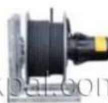
Electric Cable Winder