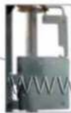
Floor Gate Key